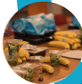
Dave Coal Creek Café